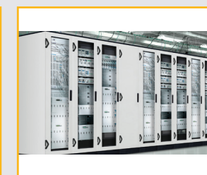
Signalling & Passenger information systems