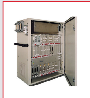
European Train Control System / Vehicle On Board Computer