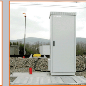
Axle counter, zone controller, wheel T°, track maintenance, interlocking.