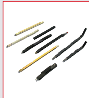
Ruggedized card retention up to 40G