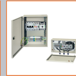
Wi-fi, Access point, Fiber splicing, Wall & Pole mount options, Full Integration Service