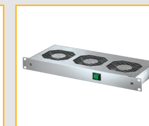
Smart cooling fan tray