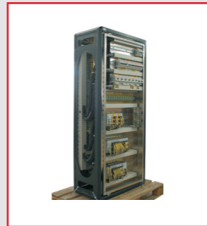
On board Cabinet 10-40U Space saving swing frame option