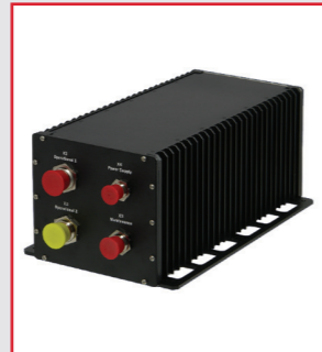
Conducted cooled With IP65 Integrated PSU & CPCI Backplane also communication BUS, also available to AAR specification