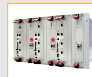
Interlocking Trackside CPCI

EN15085/AWS, EN45545, Door Opening up to 180° with locking. Wall and Pole mount. Aluminium, Mild and Stainless Steel. Cooling options include: passive and active.