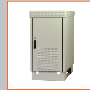
Power distribution & High voltage detection

EN15085/AWS, EN45545, Door Opening up to 180° with locking latch. Wall and Pole mount options available. Aluminium, Mild and Stainless Steel. Cooling options include: passive and active.